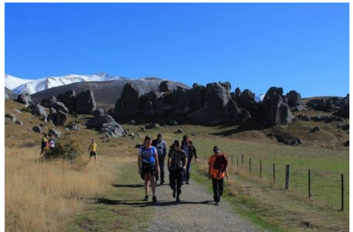
Above Karaka Class Camp at Castle Hill Below Students selected for the Top of the South team, to travel to the NZ Area Schools Tournament in Whangarei .